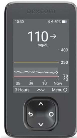
Front of Receiver Example Rendering: